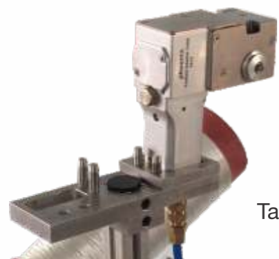
SPLICER TROLLEY Taylor made dimensions

Leather waist belt with arrangement for splicer mounting for hands free operation.