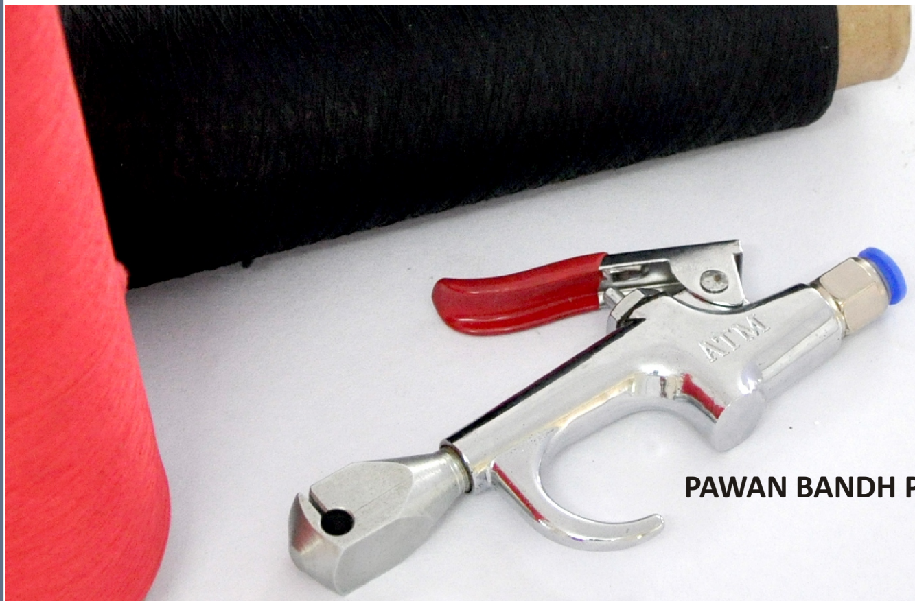
PAWAN BANDH P020

PAWAN BANDH P020 is a simple manual device for joining filament yarn. Yarn can be spliced by inserting the yarns in a chamber & introducing blast of compressed air by pressing a lever. Air injection time to suit the yarn size. tail ends are cut manually.