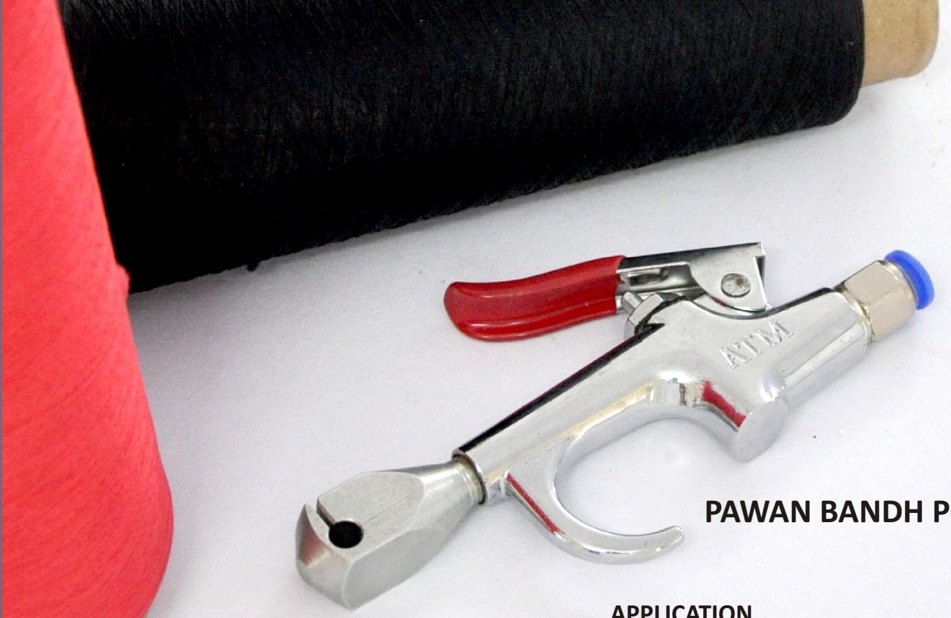
PAWAN BANDH P020

PAWAN BANDH P020 is a simple manual device for joining filament yarn. Yarn can be spliced by inserting the yarns in a chamber & introducing blast of compressed air by pressing a lever. Air injection time to suit the yarn size. tail ends are cut manually.