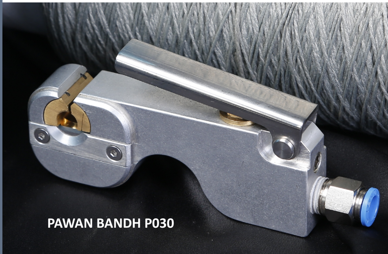
PAWAN BANDH P030

PAWAN BANDH P030 is a simple manual device for joining filament yarn. Yarn can be spliced by inserting the yarns in a chamber & introducing blast of compressed air by pressing a lever. Air injection time to suit the yarn size. tail ends are cut manually.